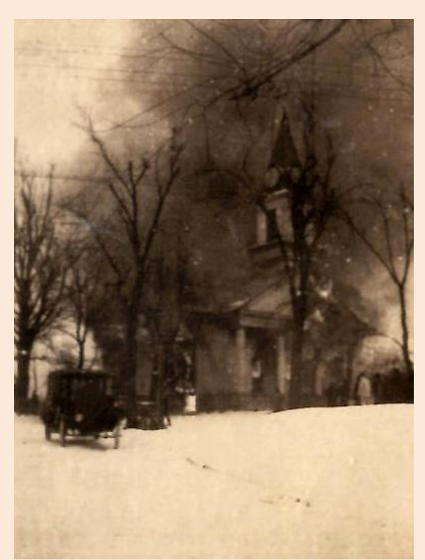
Third Meeting House Engulfed in Smoke

On the afternoon of this day in 1924, the Third Meeting House was destroyed by fire. The frontpage headline of a newspaper article from the 4th of February read: "Boylston Church is Destroyed by Fire – Historic Edifice Built in 1835 and Entire Content Lost – Damage 25,000-40,000 – Worcester and Clinton Send Aid – Rebuilding Planned." <sup>1</sup> Work to rebuild the church began on 19 April 1924. Fourth Meeting House (now Congregational Church) was completed in 1927, with a dedication service held in November. For more information see: FFF12012023 Third Meeting House.pdf